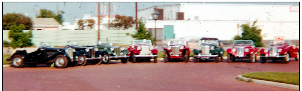
Hmmm. Eight MGs. Two must not have been in the show.