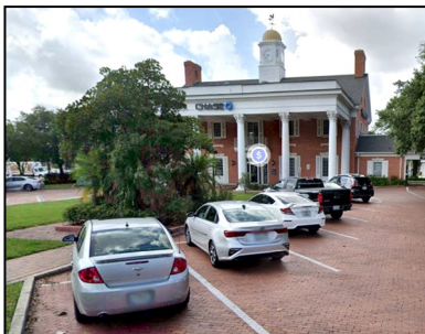
2020: The space is Chase Bank