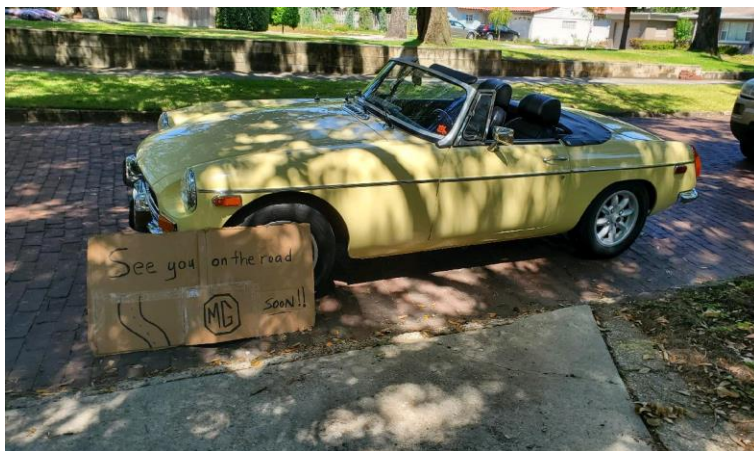
This says it all! “See you on the road, soon!!”