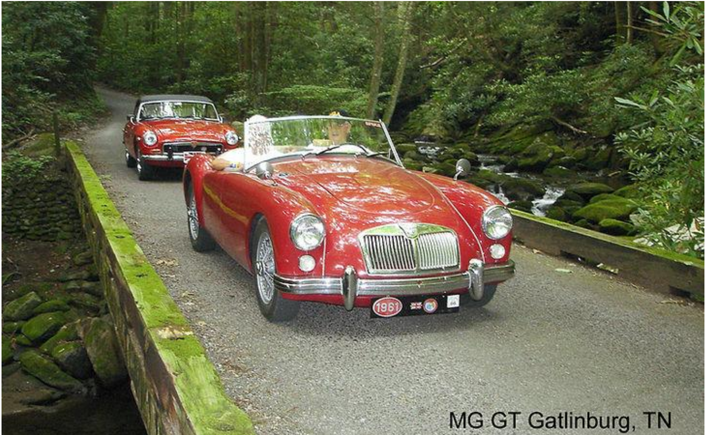
MG GT Gatlinburg, TN